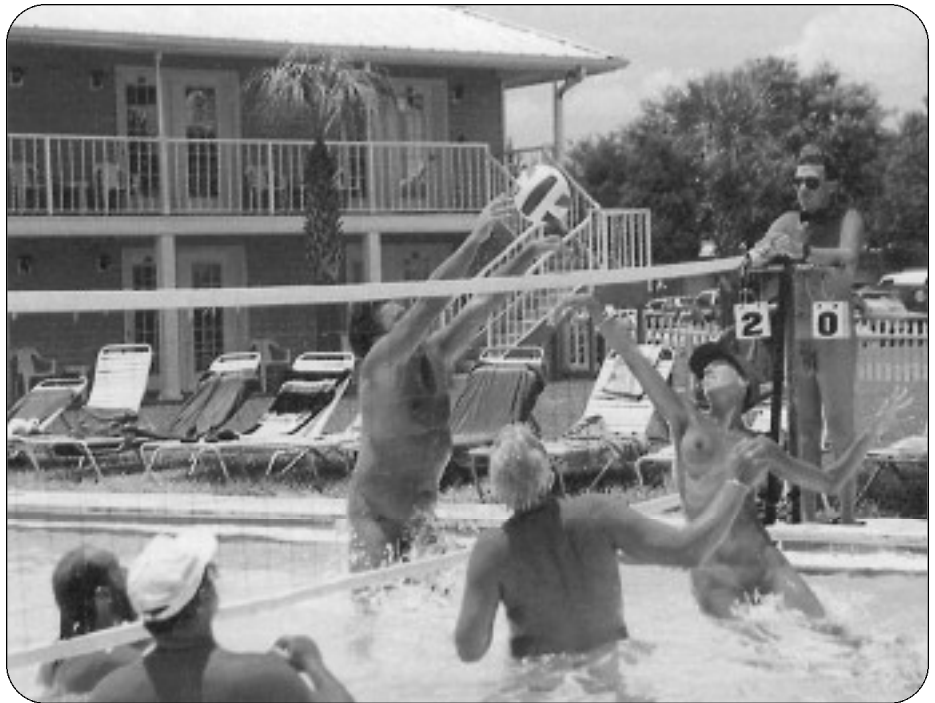
Paradise Lakes Clothing Optional Resort in Land o’ Lakes, FL has a 70-foot jacuzzi that never closes.

Spokespeople for Fort Lauderdale did not recall the incident, but pointed to the city’s code of ordinances, which, unlike the city of Miami’s,